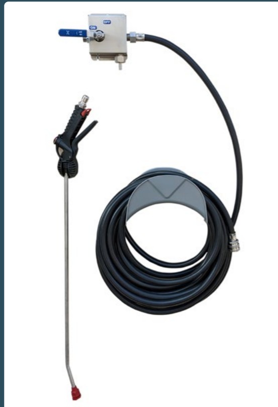
Sanigene HydroSan Disinfection Sprayer

The HydroSan disinfection sprayer is a low volume industrial spray that combines water and disinfectant for accurate spray cleaning with 12 precision dosing tips. The system uses standard mains pressure and requires no power for use, making it ultra flexible around the farm. The sprayer can be wall mounted or fixed to a farm vehicle or trolley to make it fully mobile.