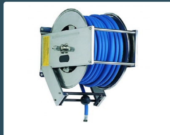
Sanigene HydroSan Hose Reel A