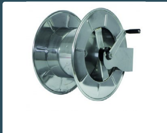
Sanigene HydroSan Hose Reel M