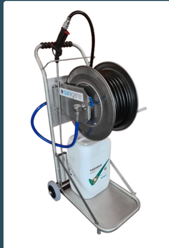
Sanigene HydroSan Disinfection Sprayer (Trolley mounted)